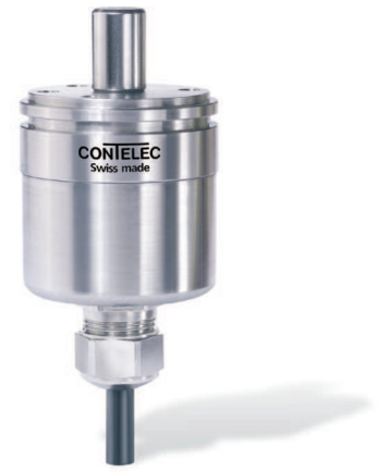
Vert-X 37 - 24V / SPI Ordering code